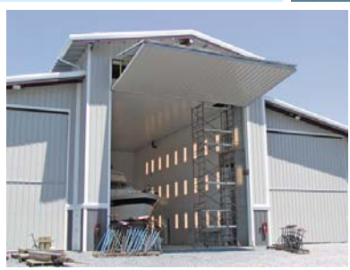
New 3-Bay Work and Paint Building